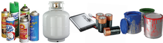
Aerosol Cans, Propane Tanks, Batteries & Paint Cans