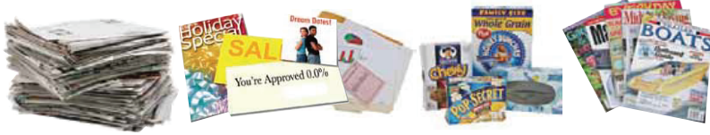
Newspaper, Office Paper, Paper Bags, Junk Mail, Paperboard & Magazines

Paper Place loose in cart. Use clear plastic bags for shredded paper ONLY .