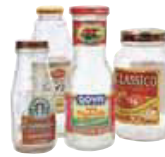
Clear Bottles & Jars