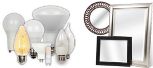
Light Bulbs & Plate Glass/Mirrors