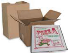
Cardboard & Pizza Boxes Flatten cardboard. Remove wax paper from pizza boxes