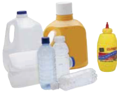
Jugs & Bottles with Small Top Openings ♻️ ♻️