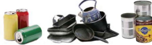
Aluminum Cans, Metal Cookware, Steel & Tin Cans