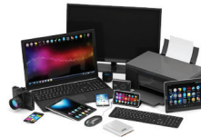
Electronics, Cords & Christmas Lights